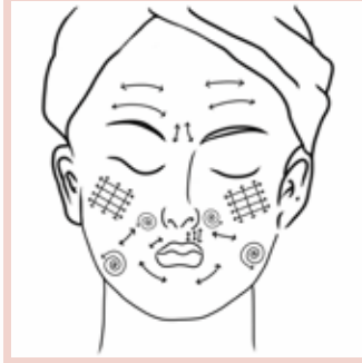
PHASE II Square pattern sweep, circular sweep Specific areas