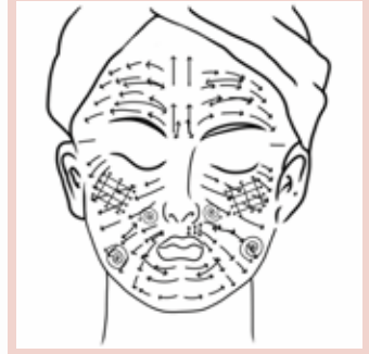
PHASE III Long linear sweep Face

The square pattern sweep technique is used with the Silver Peel